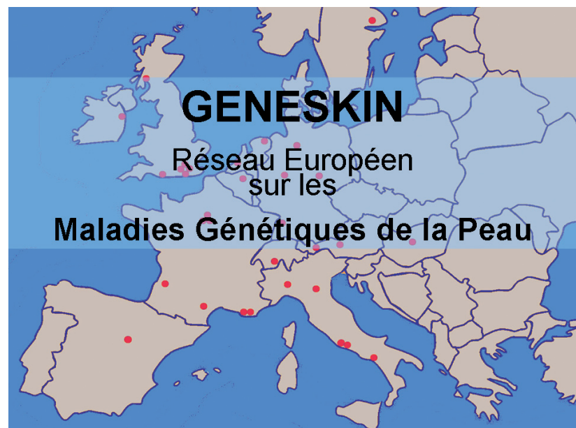
Fig. 4: The GENESKIN projects involves over 30 centres around Europe. Uppsala is the only one in northern Europe.